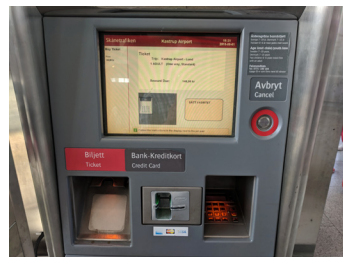
10) Card reader and keypad are located below the screen. KEEP the receipt with you