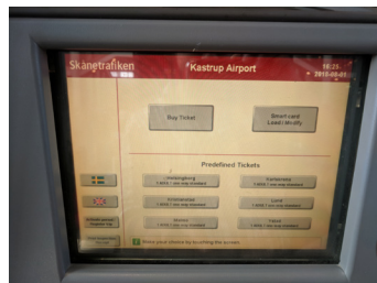
6) Ticket to Lund for 1 adult can be chosen from the preselected options. Otherwise select 'Buy ticket' and follow instructions on screen.