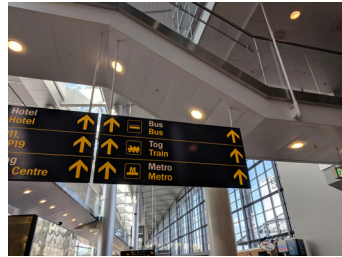
2) Follow signs to Train