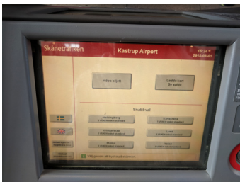
5) Change to English ;-)