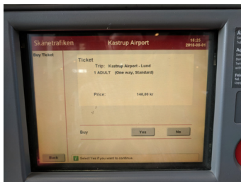
9) Check and accept fee (140 SEK/adult/one way)