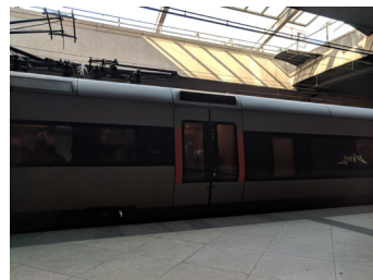
12) Board the train using any door. Virtually all trains towards Sweden stop at Lund C