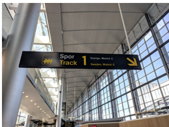
11) NOW you may use the travelator and wait for the train at the platform . There is one every 20 mins or so.