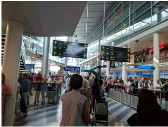
1) Exit the baggage claim area