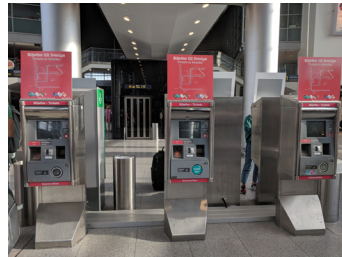
4) Nearby the travelator to the platform you can find the Swedish ticket vending machines