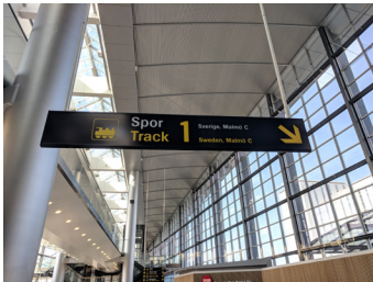
3) Locate the track to Malmö. DO NOT BOARD w/o ticket